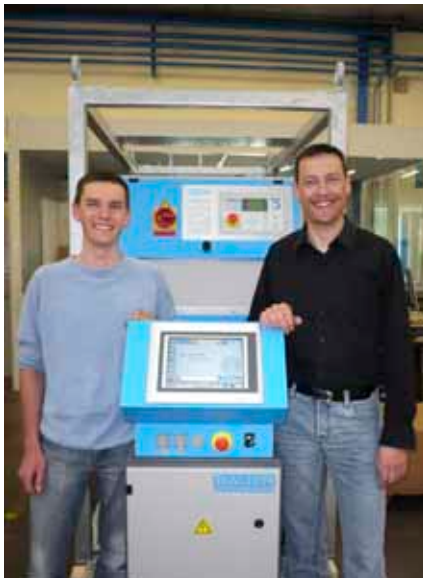
Distribution panels coordinate with the injection molding machine to control and monitor nitrogen injection.

efficient. It uses less molding material and produces parts with less weight, while also reducing the molding time per part. Customers benefit not only from more freedom in designing sections of varying thickness, but the application of uniform pressure also improves overall surface quality and produces higher stiffness.